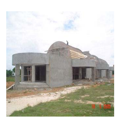
The facility is set to be finished in March 2006